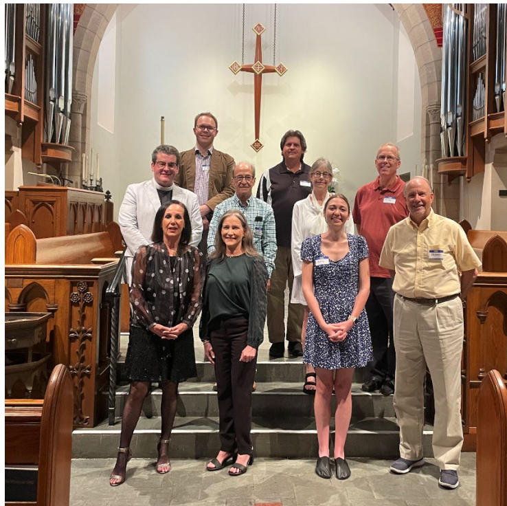
AGO Officers and Executive Committee