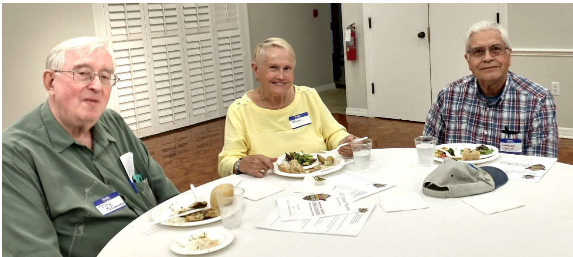
Just a few shots from our May banquet at Church of the Redeemer Episcopal